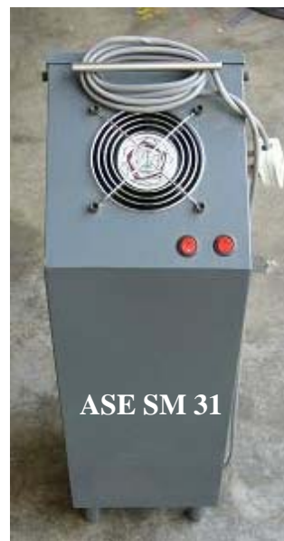
ASE Sanitol SM 30 & SM 31