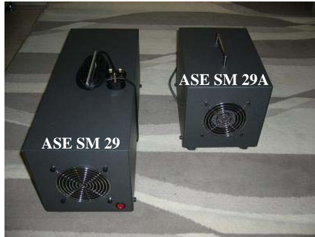
ASE Sanitol SM 29 & SM 29 A